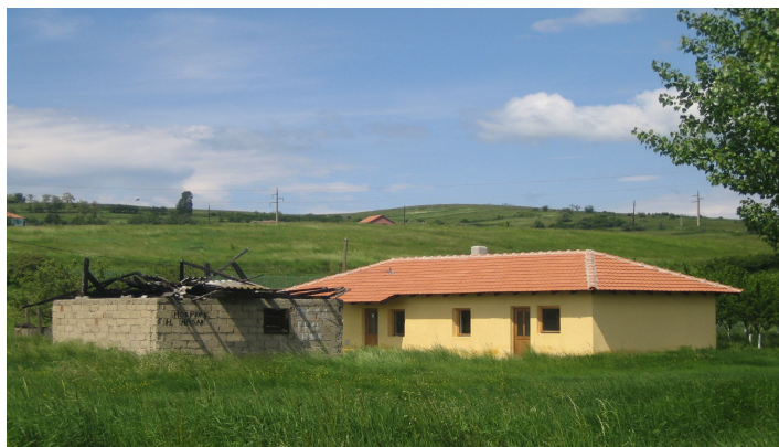
Reconstructed house next to structure destroyed in 2004 riots, Kosovo

ENABLING IMPROVED IDENTIFICATION AND ASSESSMENT AND MORE EFFECTIVE RESPONSE